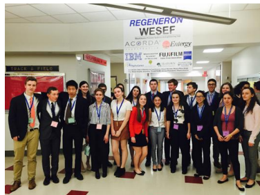
Mamk brings home top awards from Westchester Science & Engineering Fair

This month in the Mamaroneck School District, we celebrate the multiple pockets of excellence that are evident every day in the hallways of our school buildings. From music, theatre and art, to athletics, science, technology and writing, March brought many exciting student accomplishments and learning experiences. Our Boys Varsity Ice Hockey Team Brought Home their first-ever State Championship, and our Girls 4x800 Relay team became National Champions (also a first). Our Music Department celebrated jazz band awards and a record # of All-State participants . OSR raked in top science awards , and our middle and high school students celebrated the announcement that they received awards for their writing.