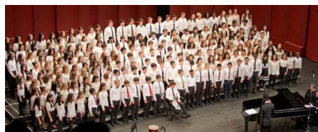
March was filled with music honors, including a record number of All-State participants