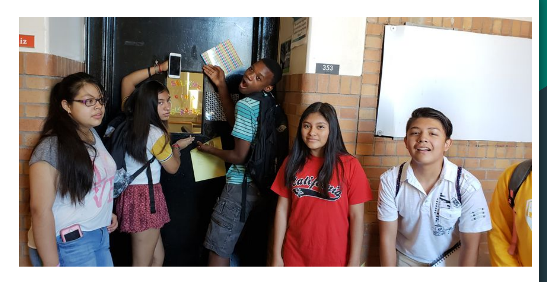
SEL in Mamaroneck: MHS - Jumpstart Program Presentation