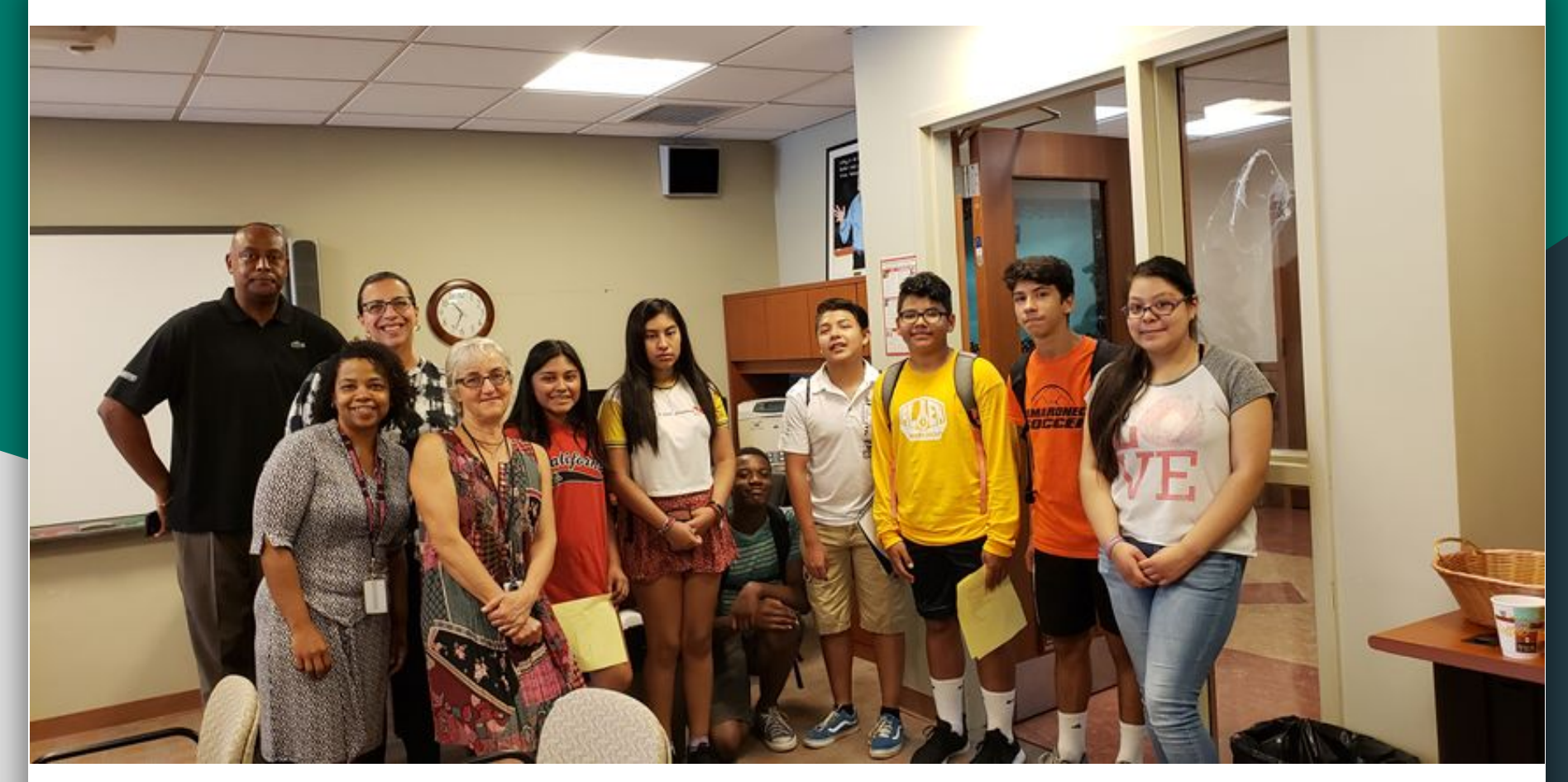
SEL in Mamaroneck: MHS - Jumpstart Program Presentation