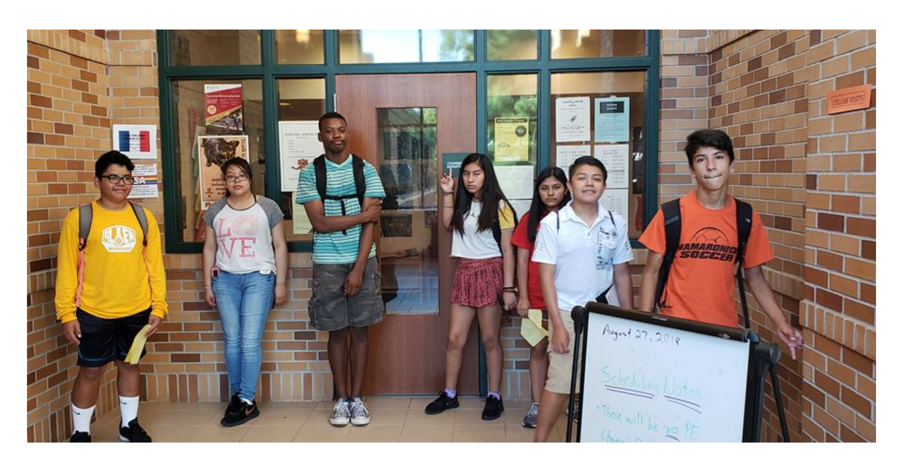
SEL in Mamaroneck: MHS - Jumpstart Program Presentation