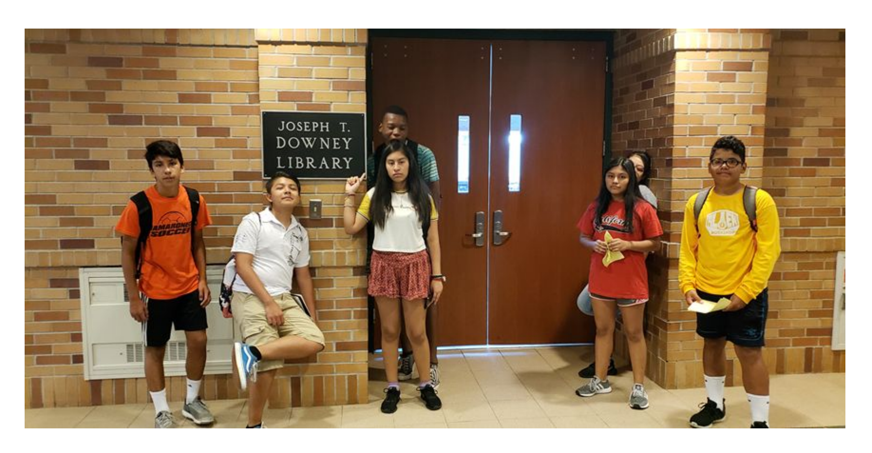
SEL in Mamaroneck: MHS - Jumpstart Program Presentation