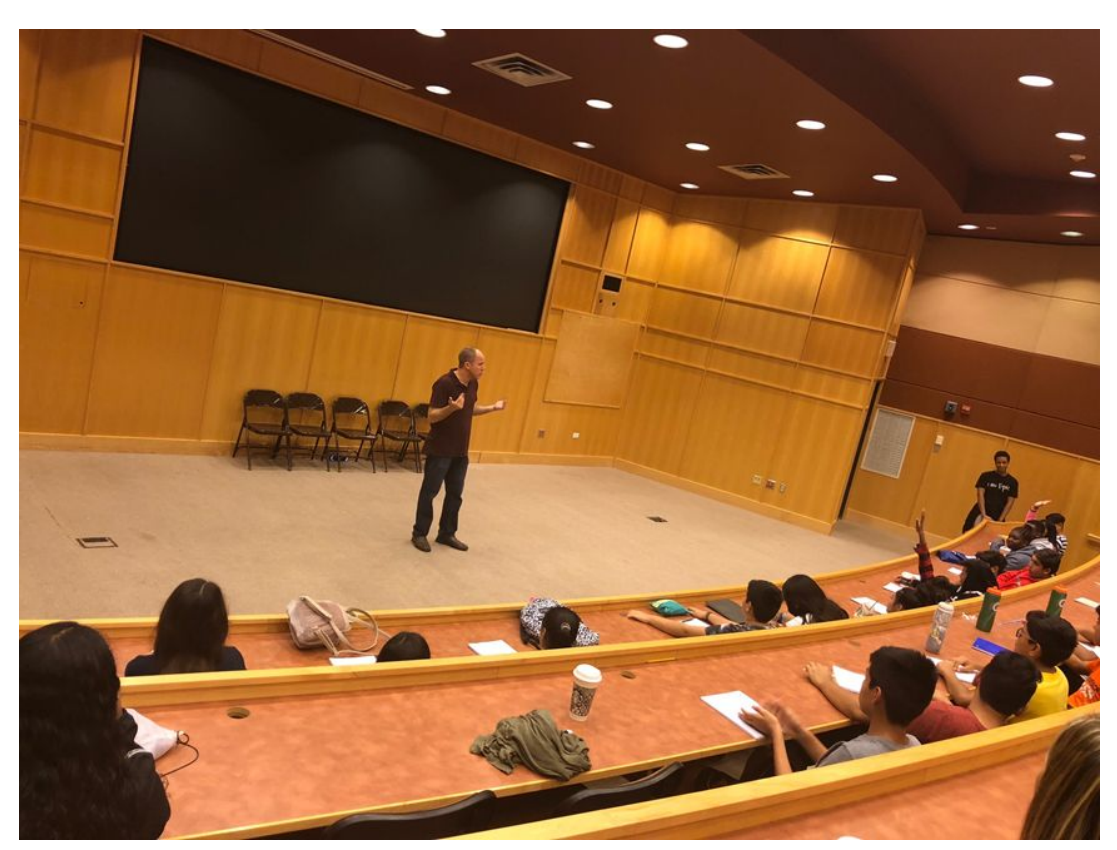
SEL in Mamaroneck: MHS - Jumpstart Program Presentation