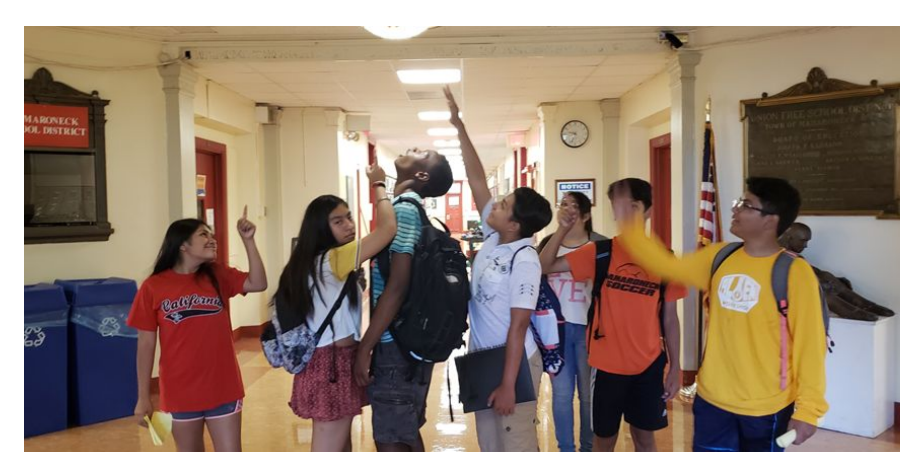
SEL in Mamaroneck: MHS - Jumpstart Program Presentation