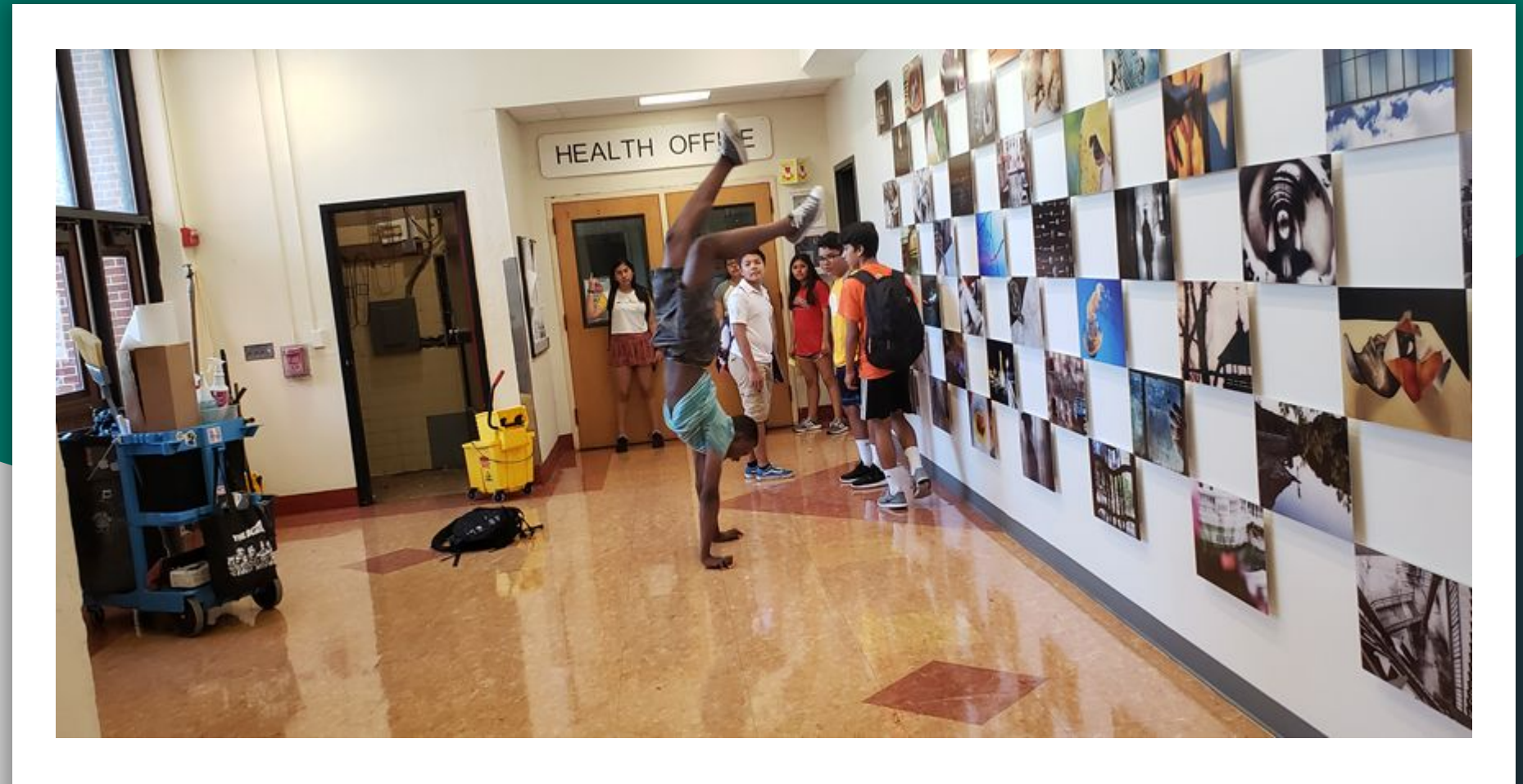
SEL in Mamaroneck: MHS - Jumpstart Program Presentation