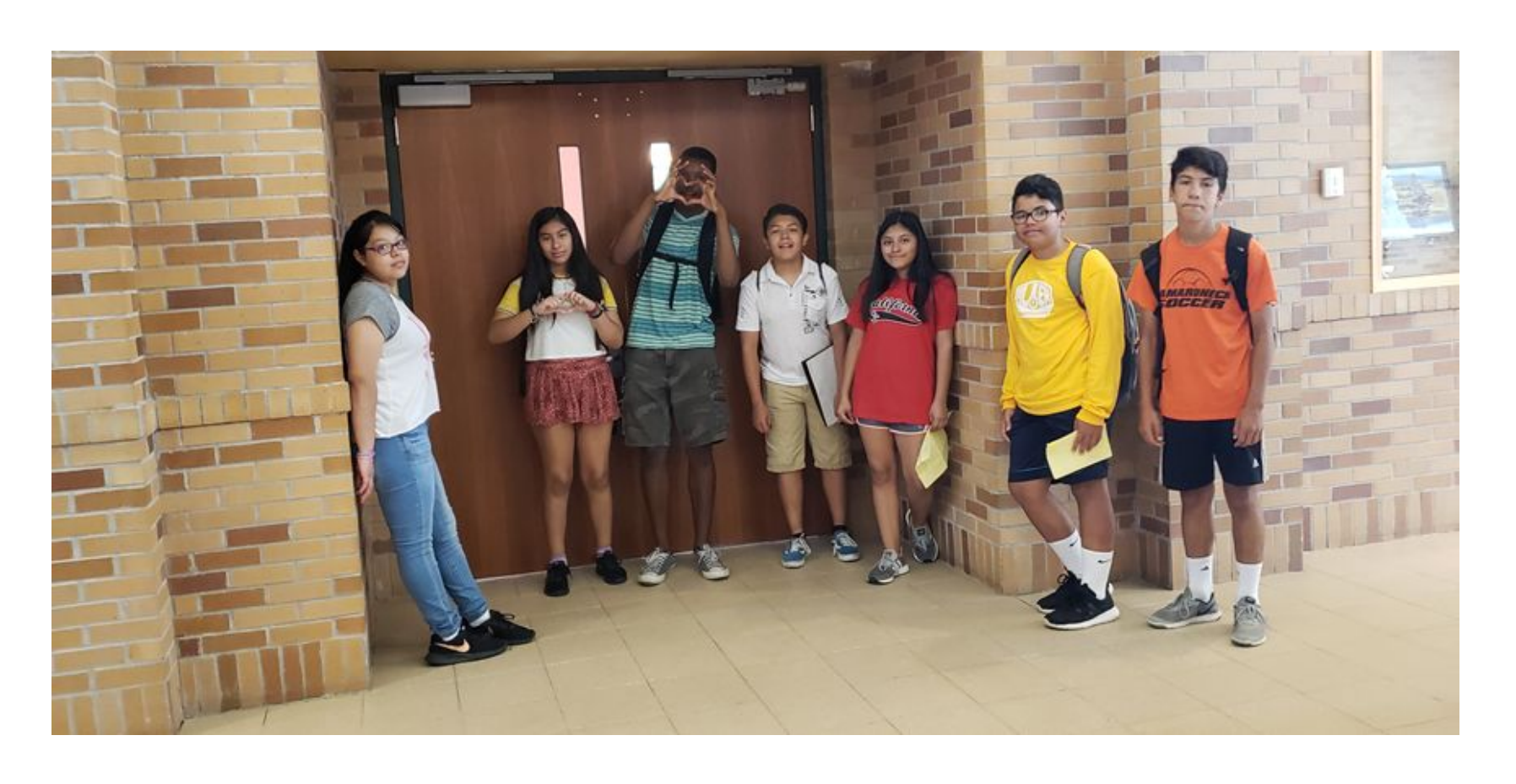
SEL in Mamaroneck: MHS - Jumpstart Program Presentation