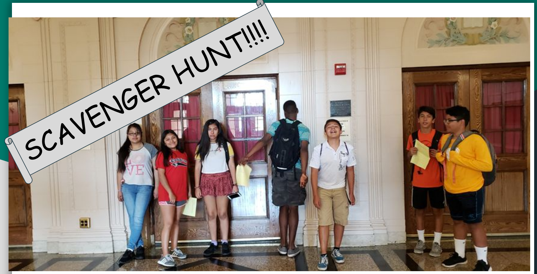
SEL in Mamaroneck: MHS - Jumpstart Program Presentation