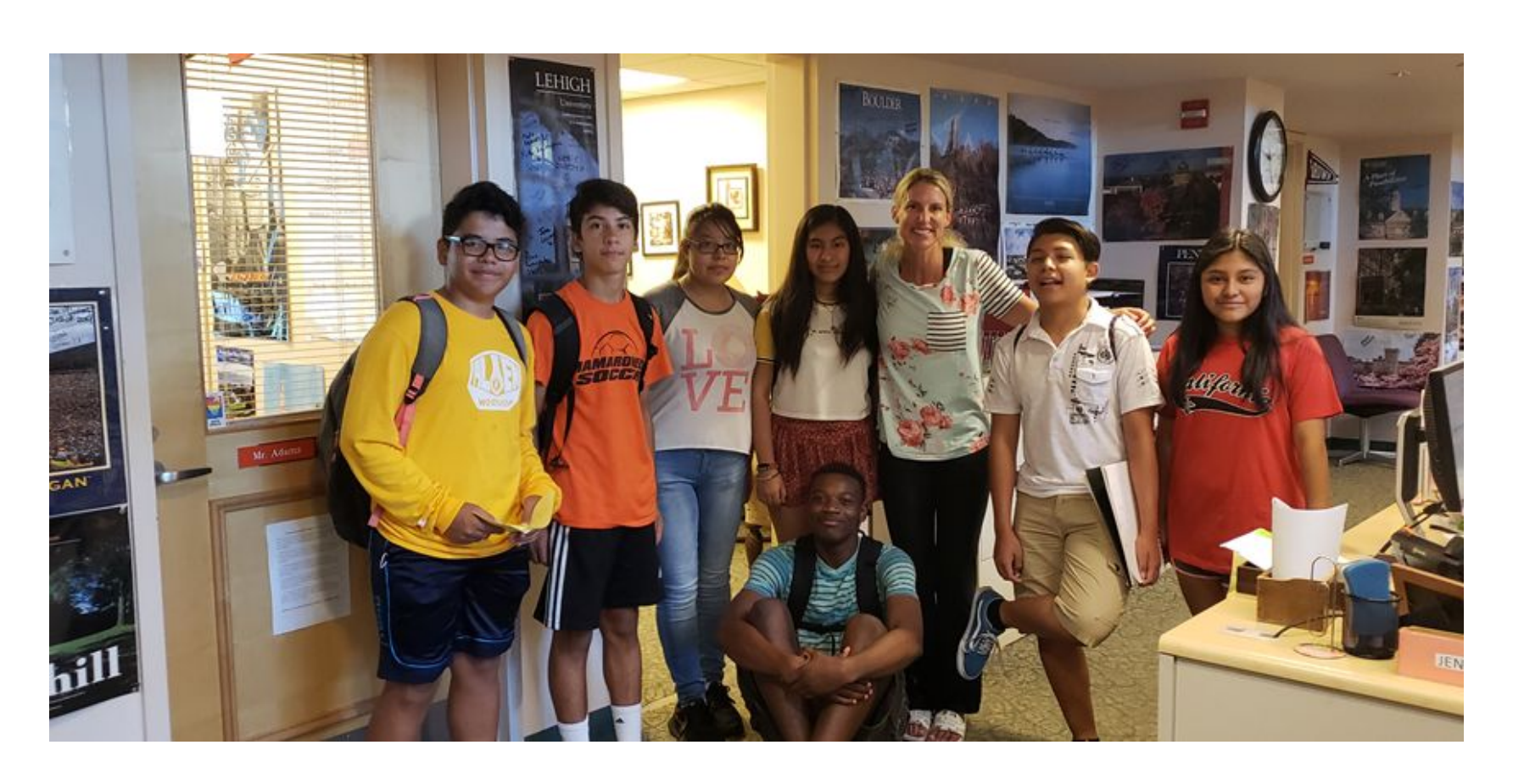
SEL in Mamaroneck: MHS - Jumpstart Program Presentation