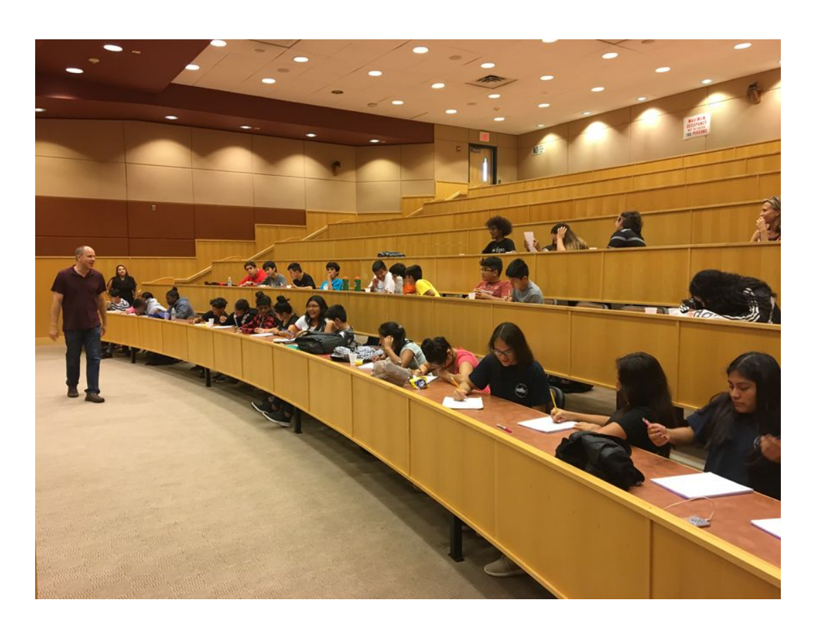
SEL in Mamaroneck: MHS - Jumpstart Program Presentation