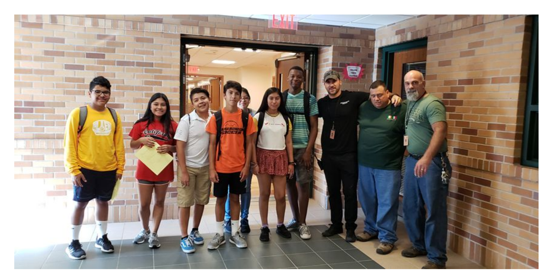
SEL in Mamaroneck: MHS - Jumpstart Program Presentation