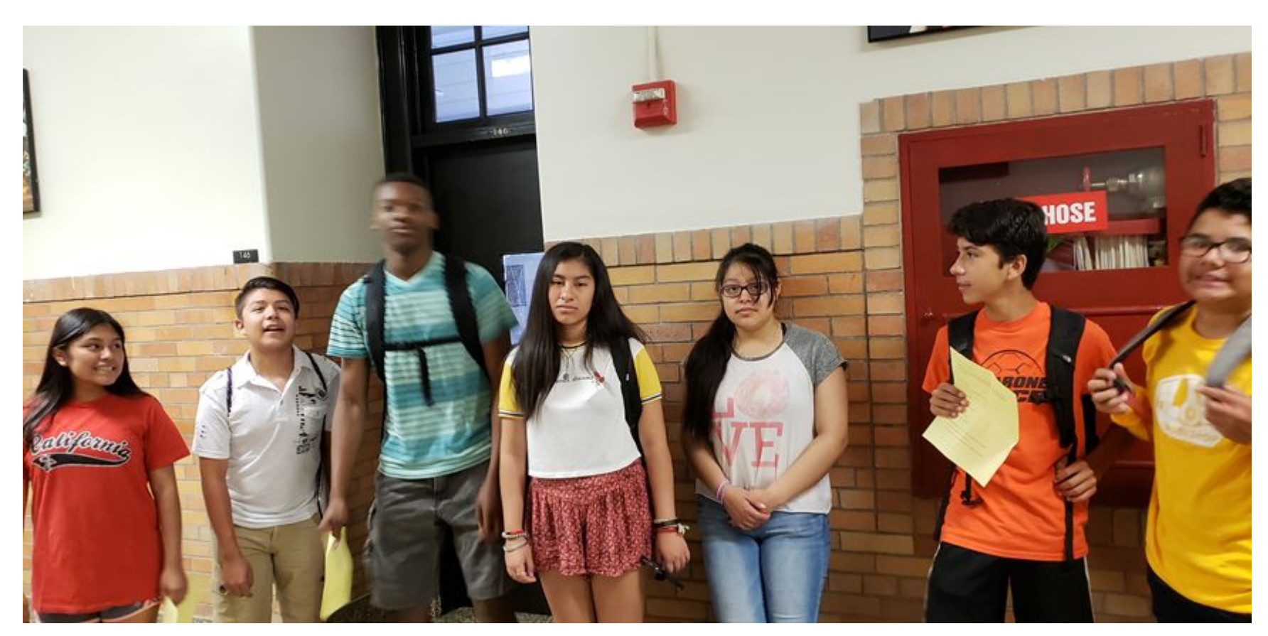
SEL in Mamaroneck: MHS - Jumpstart Program Presentation