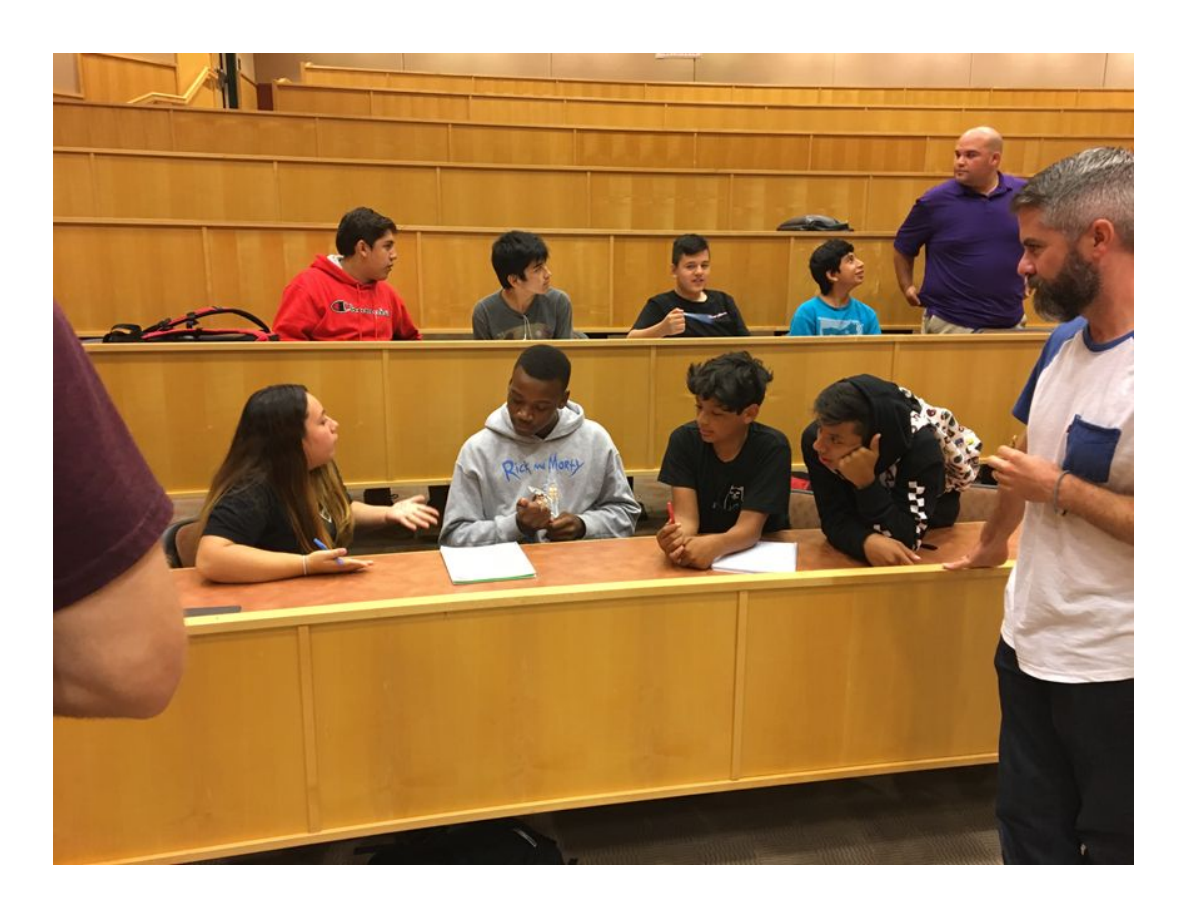
SEL in Mamaroneck: MHS - Jumpstart Program Presentation